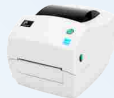
Water proof Printer